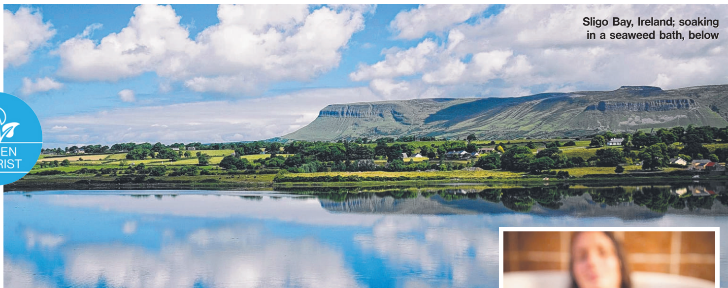
Sligo Bay, Ireland; soaking in a seaweed bath, below