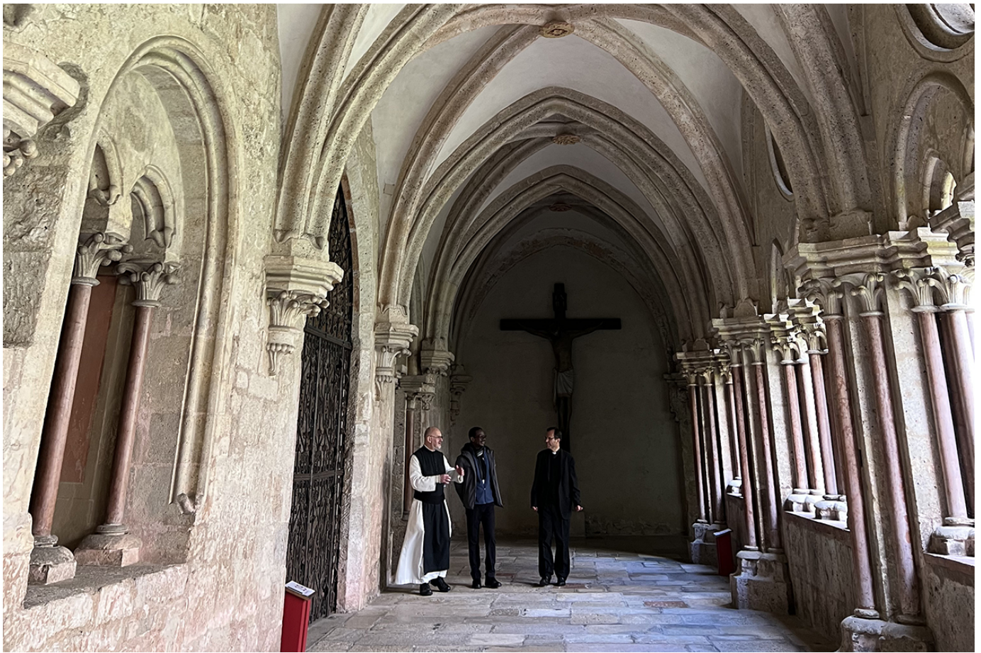
Within the cloisters of the Holy Cross Abbey.

The organisers of Limelight Arts Travel have secured excellent seats in this golden auditorium as they do with every concert we attend on our tour.