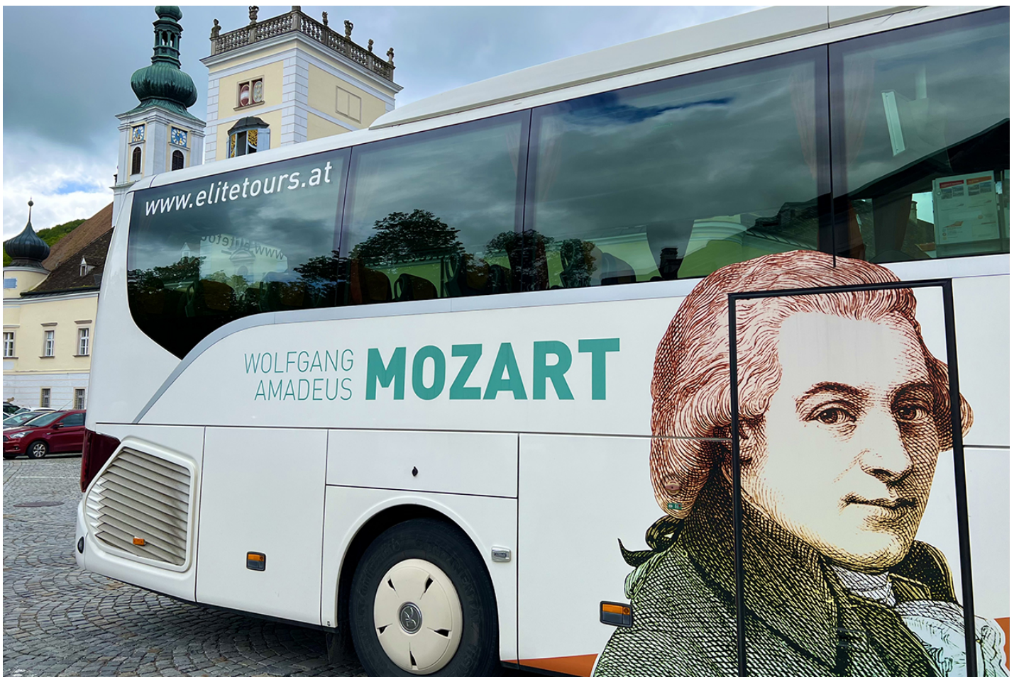
Travelling on tour aboard Mozart.

That's the beauty of joining a themed, cultural tour. You can share the joy by going with friends or go solo where you'll befriend others who share your interests. On this tour you get the cultural goods. You get the in-depth goss. You also get downtime to do your own exploring. It's a gift of slow travel.