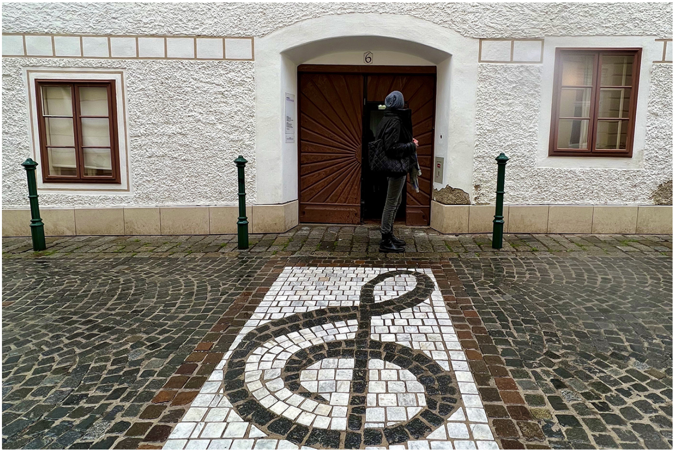
1 – Beethoven's house in Heiligenstadt, Vienna